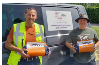
Magnox donated 20 sleeping bags.