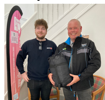
Morgan Sindall donated a large box of waterproof sleeping bags. 2